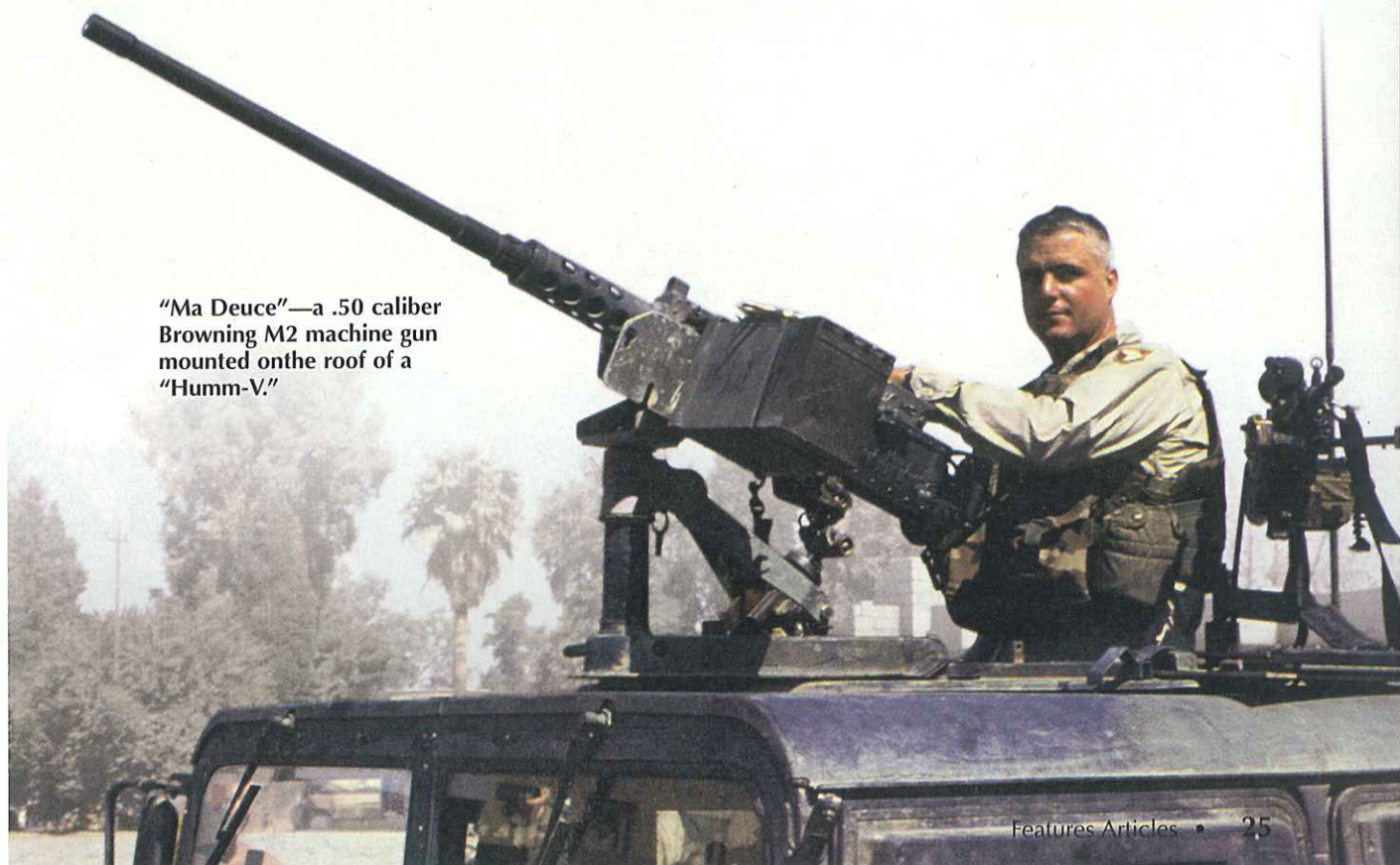
"Ma Deuce"—a .50 caliber Browning M2 machine gun mounted on the roof of a "Humm-V."