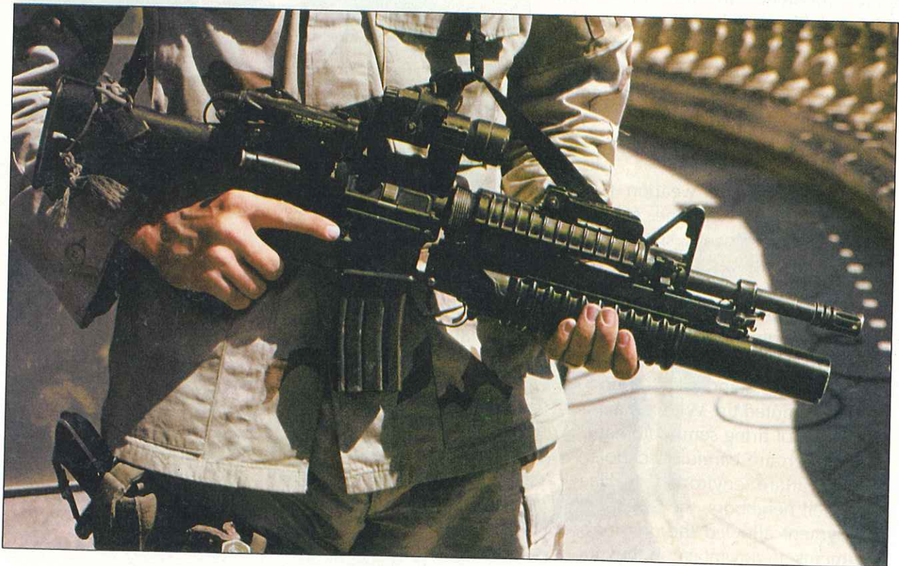
A trooper displays his well-equipped M4 carbine with attached PAQ-4C laser, iron sights and red dot day scope. Beneath the barrel is an M203 40mm grenade launcher.

The M4 is just the foundation for the integrated weapons system that gives the troopers their edge. The 101st infantry battalions are generously equipped with targeting equipment superior to what Special Forces units had a decade ago. Most obvious on almost every weapon are the M68 "close combat optics," the Aimpoint CompM2 red dot sight familiar to civilian shooters. These replaced the earlier CompMs the division had fielded for several years both in stateside training and in the Balkans and Afghanistan.