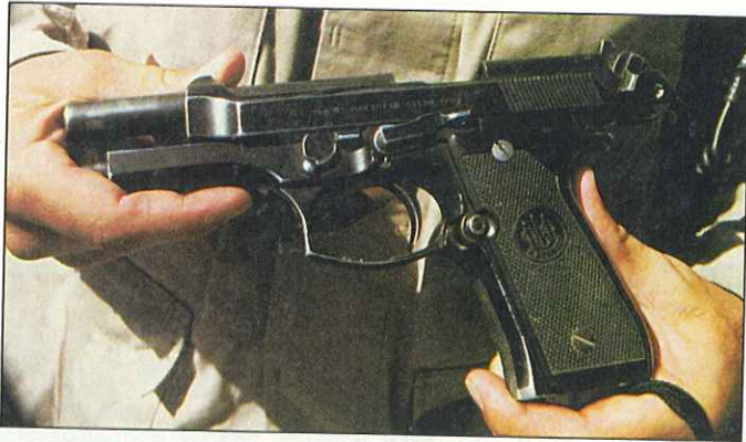
Shown here with its slide locked back, the 9mm Beretta M9 pistol was the most common side arm carried by soldiers of the 101st.