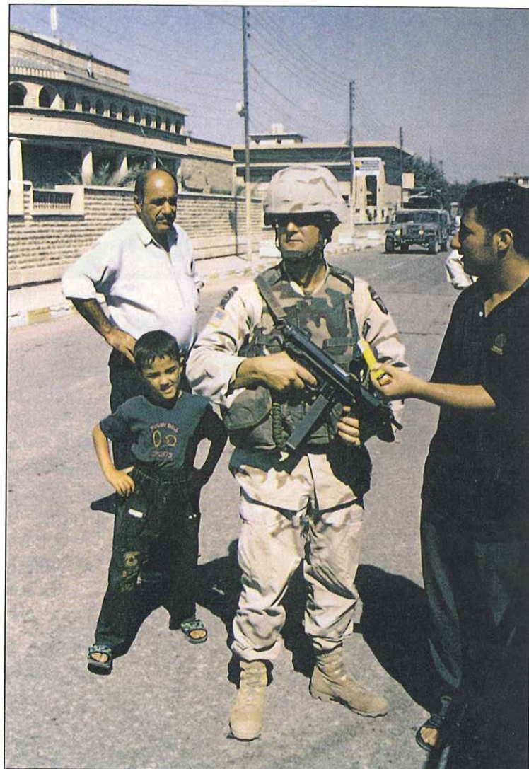
Flanked by friendly townspeople and a young admirer, a member of the 101st provides perimeter security for his company armed with a Beretta Model 12 SMG.

The primary service weapon for the division is the M-4 carbine. At six pounds, it's a full pound and a half lighter and significantly shorter (29 inches) than the 39-inch M16A2 rifle, the M4 allows the soldier a greater amount of maneuverability while the flattop Picatinny rail and the Rail Interface System, purchased separately from Knight's Armament, allow the best in accessories and optics. M4-equipped 101st troopers often jokingly refer to the 1980's vintage M16A2s of the rear echelon support units as "muskets." The M4 fires the NATO-standard 62-grain 5.56mm (.223) round, recognized by its green painted tip. With a maximum effective range of 500 meters, it is capable of firing semi-automatic or in 3-round bursts. The division's infantrymen are carefully schooled in semiautomatic fire, often in an urban warfare environment. Heavy cross training with their Fort Campbell neighbors, the 5th Special Forces Group (Airborne), in pre-deployment allowed the division's 327th, 502nd, and 187th Infantry Regiments an advantage in the close fight.